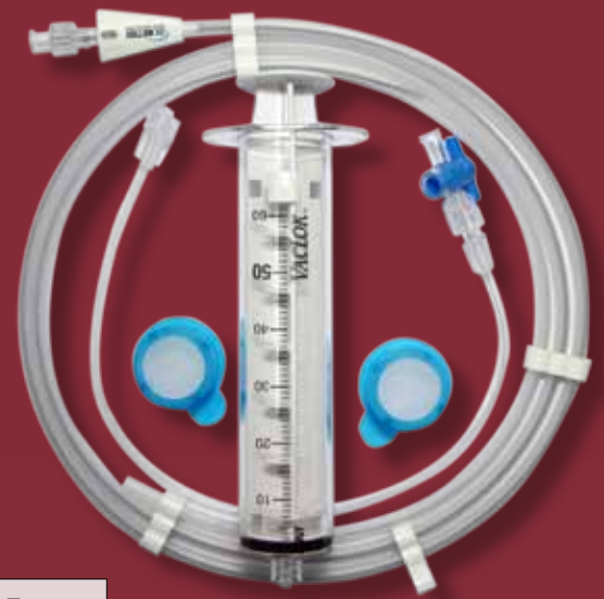
Aspiration Catheter Set

The Biometrix Aspiration Catheter incorporates a smooth tip design to increase pushability and a unique hydrophilic coating to escalate trackability. The Aspicath's excellent pushability is also due to the innovative shaft design and the kink resistance, specifically designed for aspiration catheters.